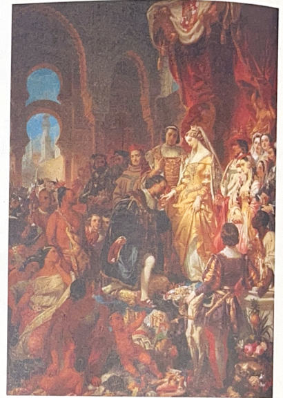
FIGURE 10-10 This painting of Columbus being received at the Spanish court after his first voyage was created by the French artist Eugène Delacroix in the 1800s.